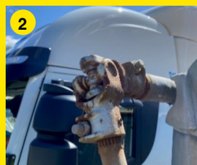
2 This UJ could do with more lubrication.