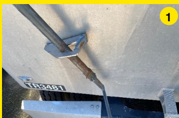
1 Close up of the locking latch in place.