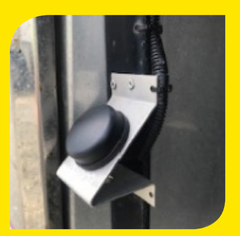
If the GPS beacon on the trailer is damaged or faulty, the system will not track the vehicle's position.