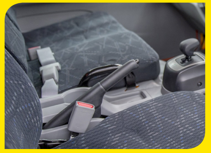
Typical handbrake lever of Cardon Shaft park brake equipped truck. You will notice the "ratchet" type feel.

Generally, a cardan shaft park brake system uses a ratcheted handbrake lever and cable to apply the brake – similar to what you would find in your car. You will know if the vehicle is equipped with a Cardan shaft park brake from the "ratchet" feel of the lever. It can also be a pull type lever next to the steering column. Larger trucks may have an air operated switch incorporated.